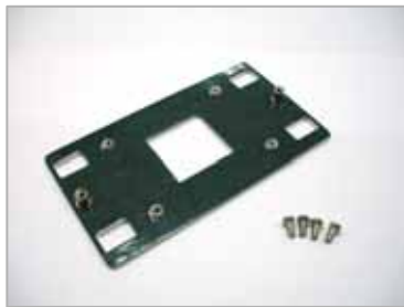
Tt Socket F Back plate P/N: CL-O0010