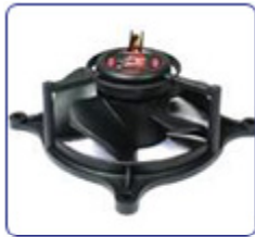
Silent Reversed Fan